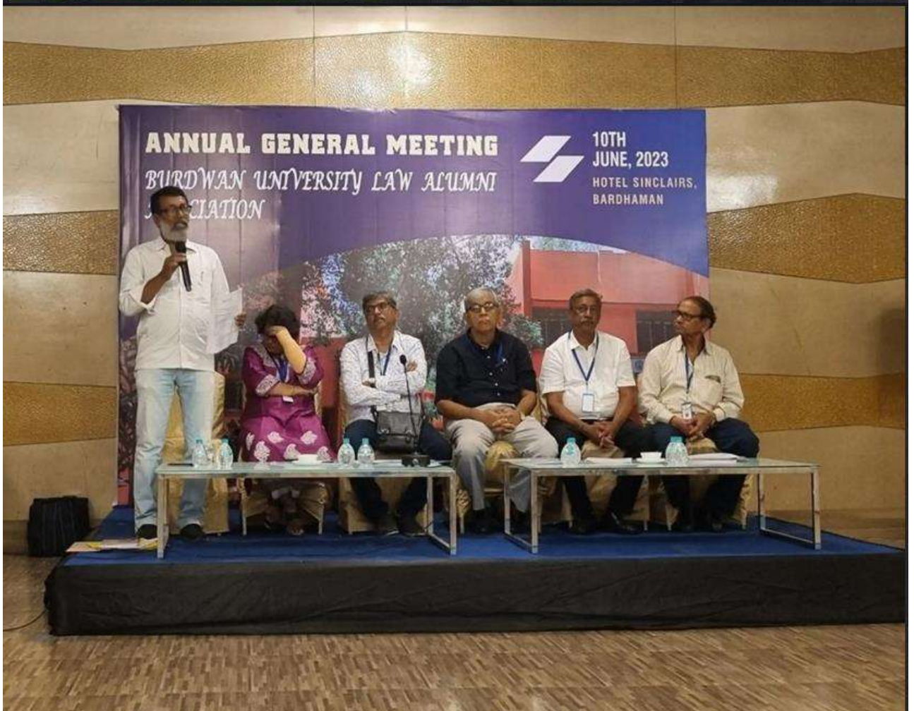
ReUnion / Alumni Meet _ Department of Law 2023