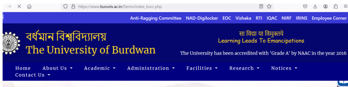
Fig. Anti Ragging Committee and helpline tab in the front page of the University of website

The BU has already established an Anti-Ragging Committee (ARC) and an Anti-Ragging Squad (ARS). The contact numbers of the ARC and ARS have been provided on the front page of the University website.