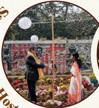
Sarojini Girl's Hostel