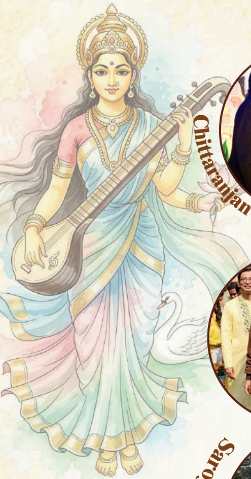
Chittaranjan Boy's Hostel