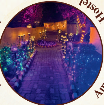
Aurobindo Boy's Hostel