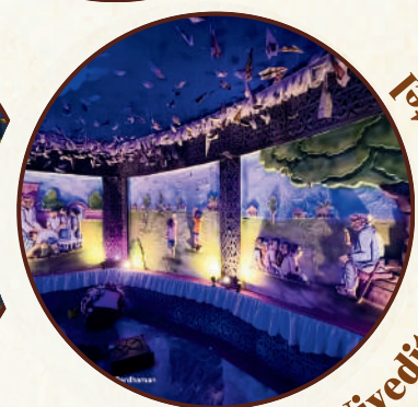
Nivedita Girl's Hostel

At the University of Burdwan, Saraswati Puja is far more than a religious observance—it is a vibrant celebration of creativity, unity and student life. Much like Kolkata's famed Durga Puja, this festival at the 12 university hostels reflects months of dedication, where students craft idols, design elaborate mandaps and transform their surroundings with artistic brilliance. A friendly creative rivalry among the hostels adds to the excitement, encouraging students to discover and showcase hidden talents beyond academics.