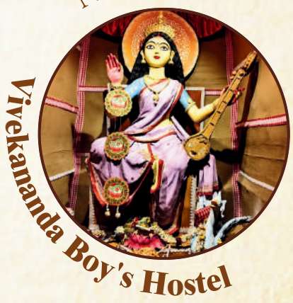
Vivekananda Boy's Hostel

The three-day celebration begins with prayers, Pushpanjali and Prasad, followed by the Tatta-Satta ceremony (exchange of gifts in well decorated traditional trays among all hostels) that strengthens bonds of friendship. Finally, the festival ends with Shovayatra (colourful procession) and concludes with the immersion (Nirajan) of the idol. Though the festivities end, they leave behind cherished memories of laughter, companionship, and shared joy—moments that remain engraved in the hearts of all, long after the puja mandap (the decorated place of worship) stands empty.